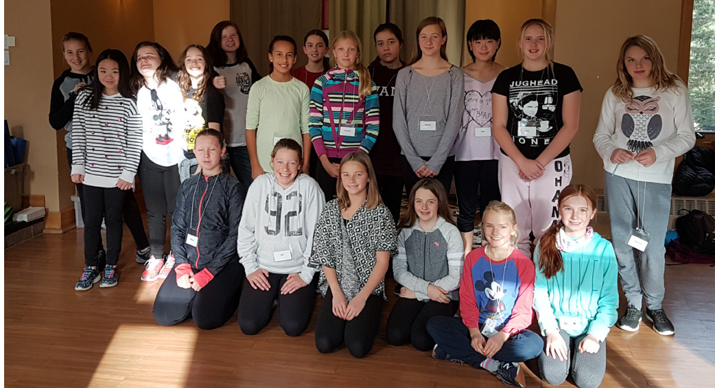
ABOVE: POWER OF BEING A GIRL TEEN PARTICIPANTS

Volunteer with us ywcabanff.ca/ how-you-can-help/ volunteer/