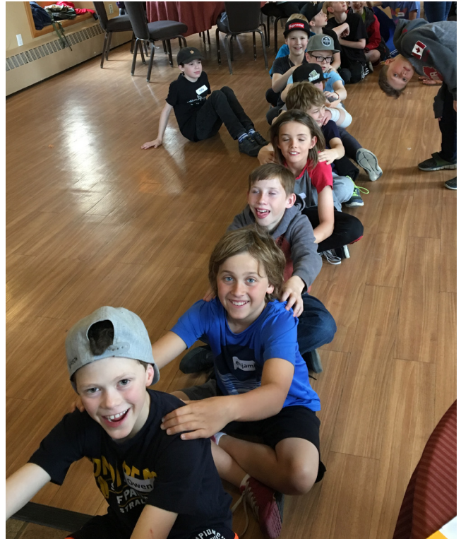
Strength in Being a Boy conference

A strong motivator for developing our strategy for engaging men and boys in violence prevention is to help break the cycle of abuse. This means supporting boys with strategies to overcome unhealthy gender stereotypes that can, over time, have a negative impact on their relationships. Each year the YWCA hosts the Strength in Being a Boy conference for boys in grades 4, 5, and 6 in partnership with Calgary's Centre for Sexuality and facilitators from their WiseGuyz program. This year, 24 participants enjoyed a day of activities during which facilitators provided targeted education focused on tools to pursue safe, healthy relationships and maintain their long-term mental and physical well-being.