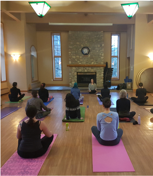
Women's Circle participants enjoy a yoga class at the YWCA.