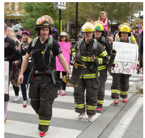
Walk A Mile 2018