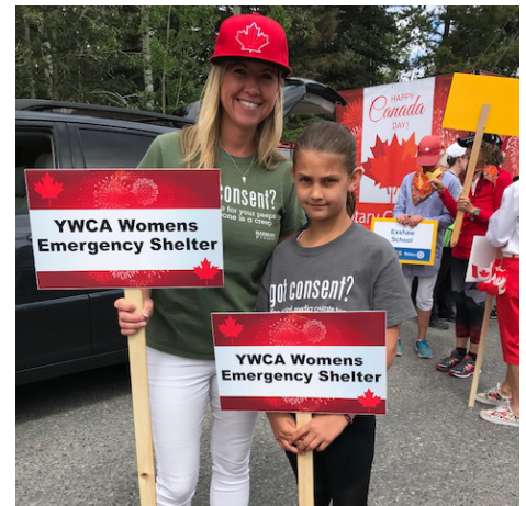
Rotary Club - Canada Day