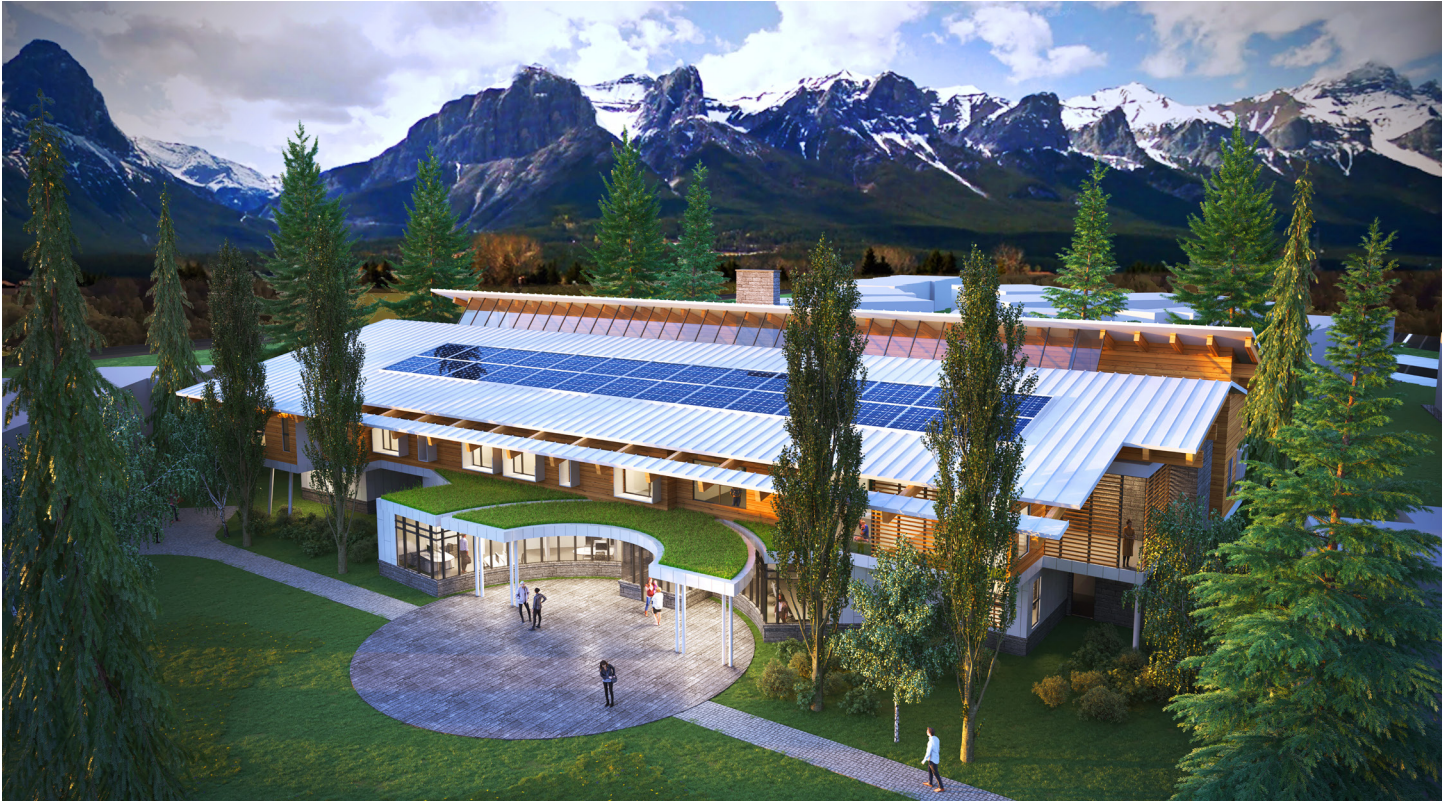
Early draft of a design concept for the Higher Ground facility in Canmore.

The Higher Ground Project is our plan to bring a new, purpose-built facility to Canmore with a range of services that address domestic and sexual violence in the Bow Valley. Core programming at Higher Ground will include crisis intervention, counselling, second stage shelter, transitional housing, community outreach, training and education programs, and supports and resources for children. Our goal is to open Higher Ground in Canmore by 2021/22.