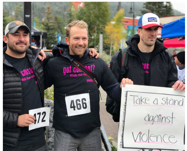
Participants from Walk A Mile 2018