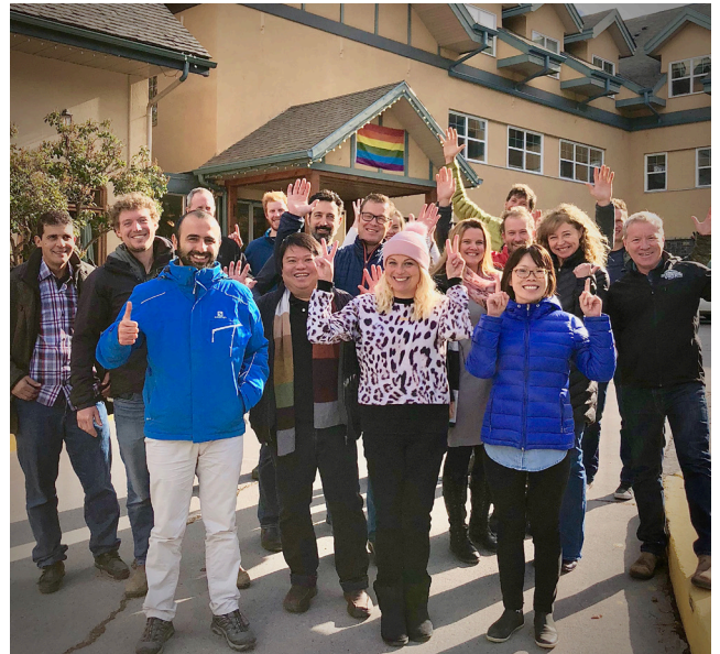
Leading Change training program participants

In October 2018, the YWCA hosted Leading Change, a gender-based violence prevention training program developed by the Alberta Council of Women's Shelters (ACWS). Men from throughout the Bow Valley volunteered their time to attend this three-day training where they had the opportunity to increase their knowledge of issues surrounding domestic and sexual violence. After their training, 100% of the men who took part felt better equipped to prevent or interrupt abusive behaviours against women and girls. We continue to engage with the participants to help them share their new knowledge with their networks in impactful ways.