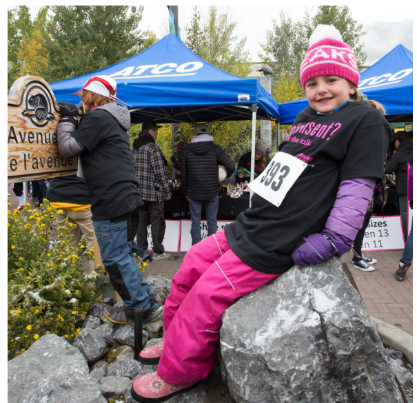
2018 Walk A Mile participant wearing a signature "Got Consent?" t-shirt