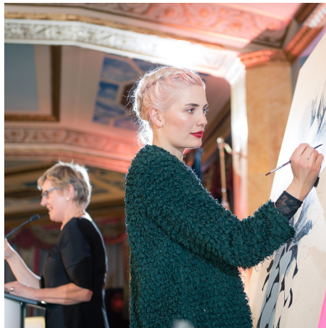
VINEart Gala Auction, Fairmont Banff Springs Hotel