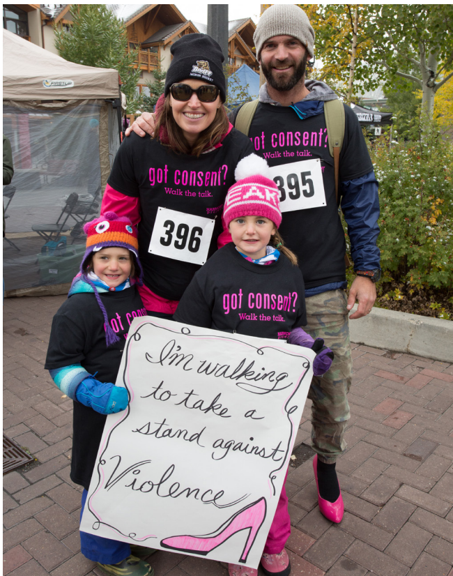
A family photographed at 2018 Walk A Mile