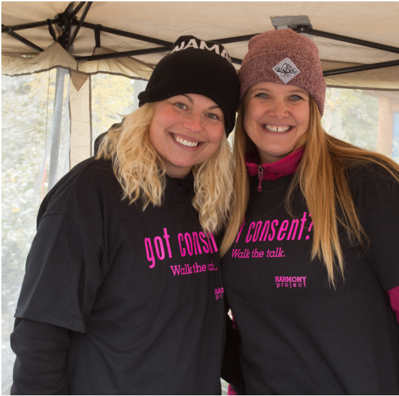
YWCA staff at Walk A Mile 2018

In support of our mission to shape a safe, inclusive community that empowers women and girls, our work is focused on four strategic priorities: