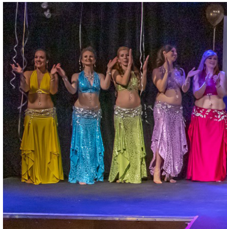
Dance for Joy