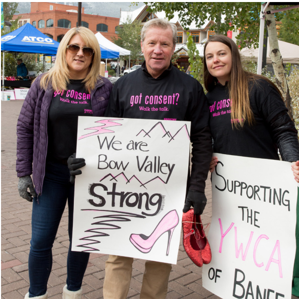
YWCA staff at Walk A Mile 2018