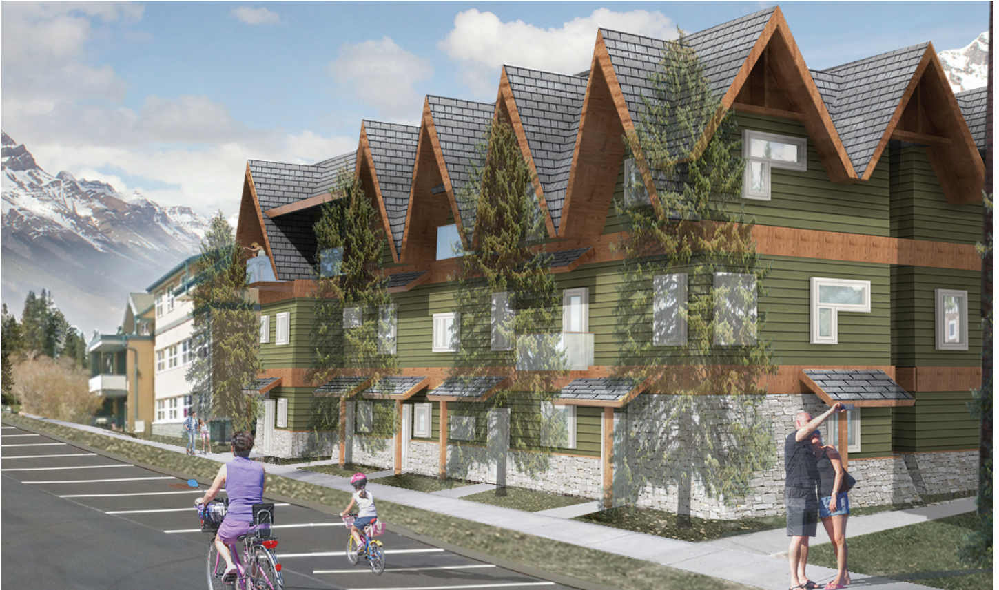
Exterior rendering of Courtyard Project in Banff, slated for occupancy in spring 2020

Over the past year, our Courtyard Project has taken some exciting steps forward! This 33-unit, 3-story project will meet net-zero targets for energy efficiency and provide affordable, self-contained rental housing for up to 75 residents. The units will be ideal for women, new and extended families, individuals, and people with accessibility needs. In 2018, the Provincial Government made a significant contribution of $2.6 million, and the Federal Government, through the National Housing Strategy's Housing Innovation Fund, committed to $1.35 million. Our goal is to contribute to a thriving neighborhood through the Courtyard's offering of suitable, affordable housing and relevant supports that together foster a sense of belonging, security and community pride.