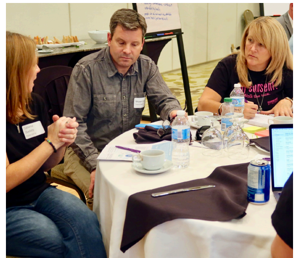
Attendees of the community consultation brainstorm ideas for Higher Ground.

Attendees addressed the need for a place that breaks down stigma surrounding domestic and sexual violence and related issues, and that strengthens community connections for all residents. The findings from the 70+ community members who attended the consultation are helping to guide the project's next steps. We look forward to hosting further consultations with the public as the project progresses.