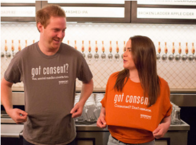
Staff from High Rollers wear the 2018 Got Consent t-shirts