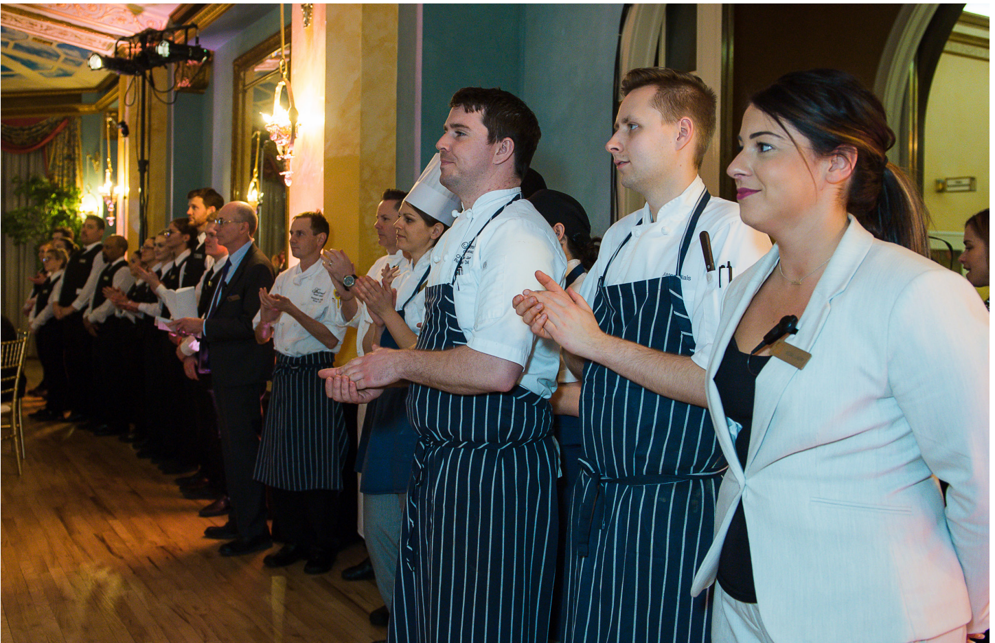
Fairmont Banff Springs culinary team gets a round of applause at 2019 VINEart Gala Auction

We are so grateful to count the Fairmont Banff Springs as a community partner!